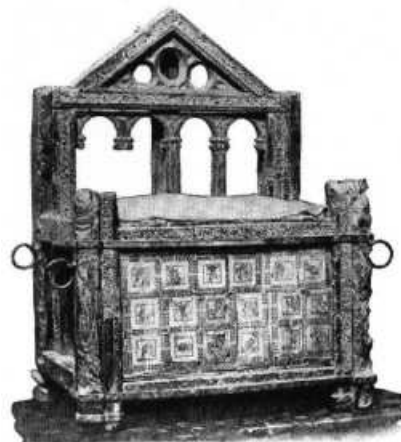
CHAIR OF ST. PETER (Vatican Basilica)

According to the examination then made by Padre Garucci and Giovanni Battista de Rossi, the oldest portion is a perfectly plain oaken arm-chair with four legs connected by cross-bars. The wood is much worm-eaten, and pieces have been cut from various spots at different times, evidently for relics. To the right and left of the seat four strong iron rings, intended for carrying-poles, are set into the legs. Here is an image of the ancient chair: